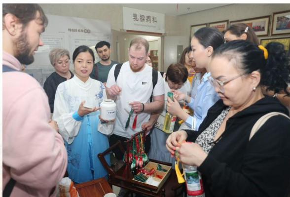
Kazakh Students Experiencing Making Traditional Chinese Sachets