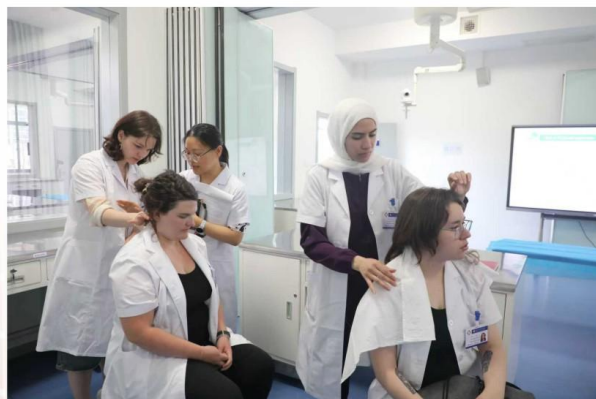
Russian Students Studying Tuina Manipulations