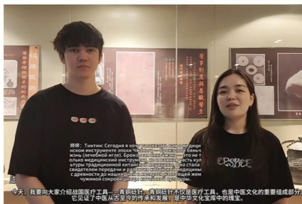
Students Taking Part in the China International College Students' Innovation Competition