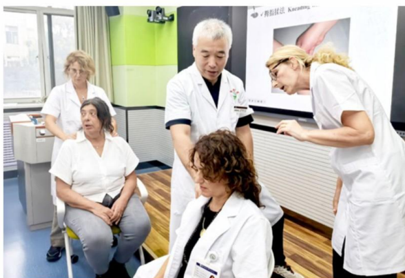
Italian Students Studying Tuina Techniques